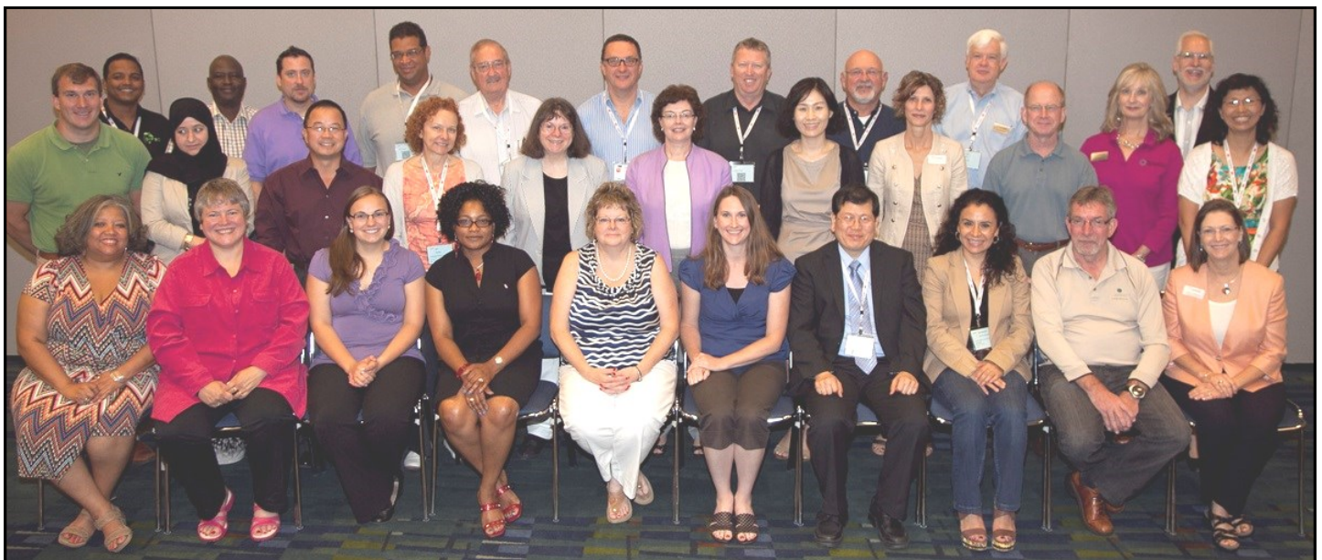
IAFP 2013 Affiliate Council Delegates

*Delegate is currently not an IAFP Member, as of April 15, 2014 (a requirement under IAFP Bylaws).